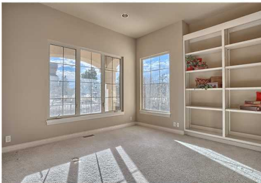
Copyright © 2012 - RSC Office on Main Level Across from Master has Mountain Views and Built in Shelving!