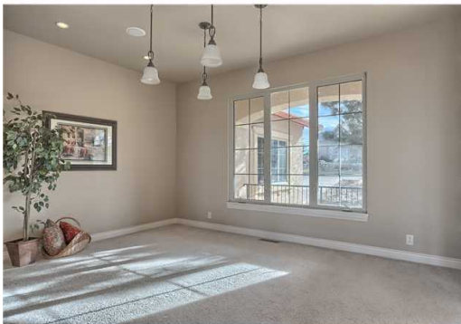
Copyright © 2012 - RSC Formal Dining Room!