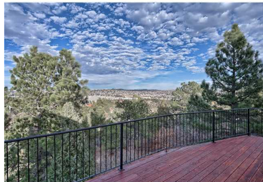
Amazing Views From Deck