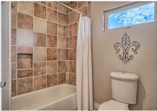
Copyright © 2012 - RSC Bathtub Upstairs!