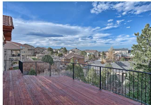
Another View of the Deck!