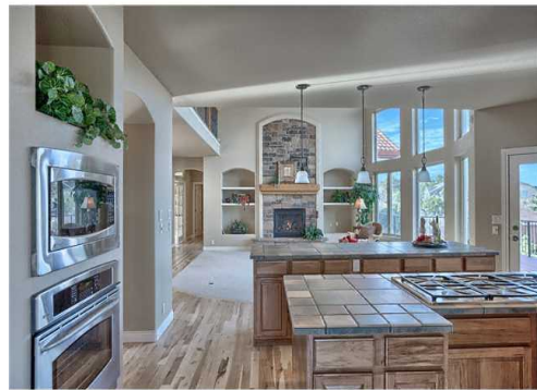
View of Kitchen to the Great Room! Entertainers Dream Home!