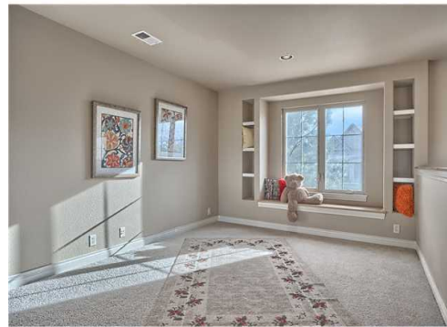
Copyright © 2012 - RSC Loft Area that overlooks the great room!