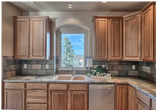
Copyright © 2012 - RSC Hiclory Cabinets are in Prestine Condition!