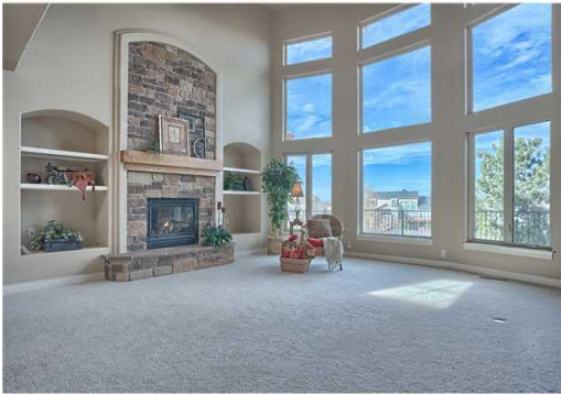
Copyright © 2012 - RSC Amazing Great Room with Floor to Ceiling Windows!