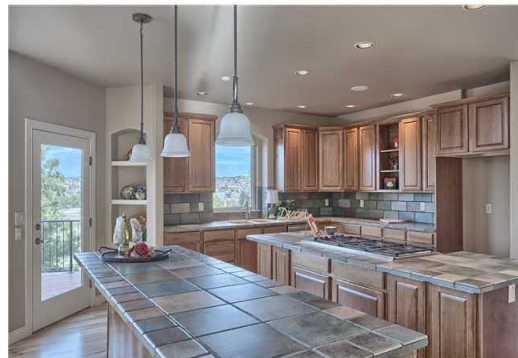
Copyright © 2012 - RSC Amazing Gourmet Chef's Dream Kitchen with Island and Breakfast Bar Seating!