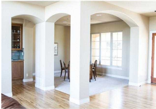
Copyright © 2012 - RSC Formal Dining Room with Arches!