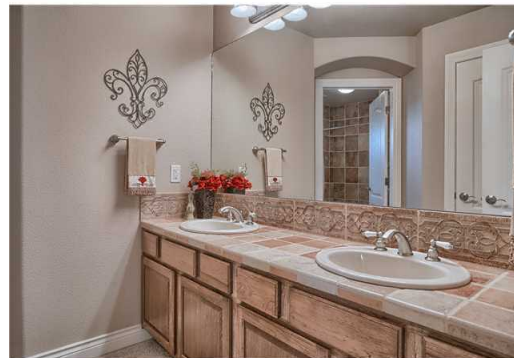
Copyright © 2012 - RSC Bath Upstairs has dual sinks!