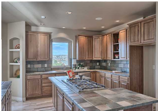
Copyright © 2012 - RSC 6 Burner range, Tile Countertops, and Kickory Cabinets!