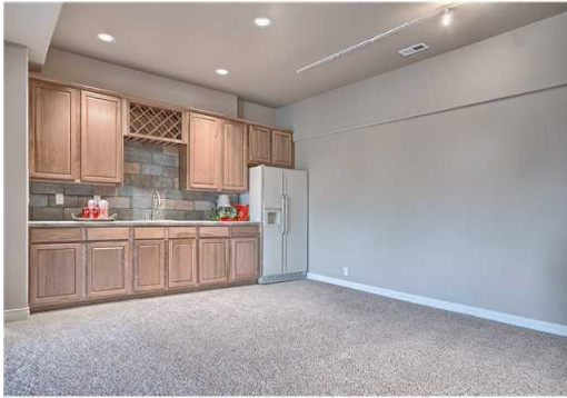
Copyright © 2012 - RSC Wet Bar and Game Area/Could be a theatre area as well!